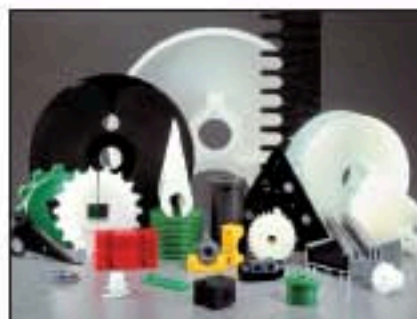
Plastic & UHMW Shapes