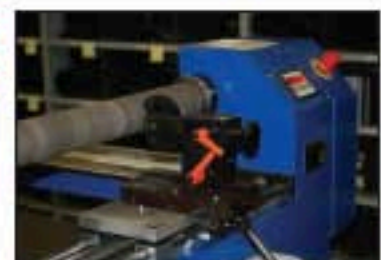
Optibelt Synch Belts