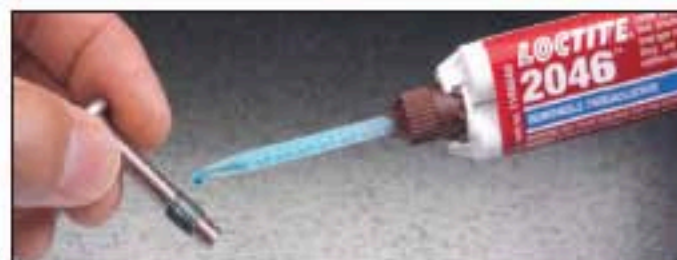
Loctite Food Grade Threadlocker